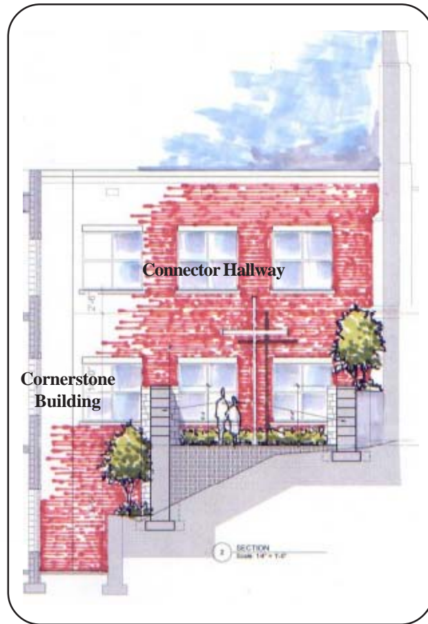
Renderings by TWH Architects, Inc.